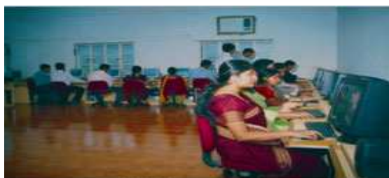
GCDMS Computer Lab - 2