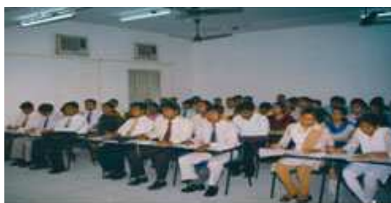
GCDMS Class Room